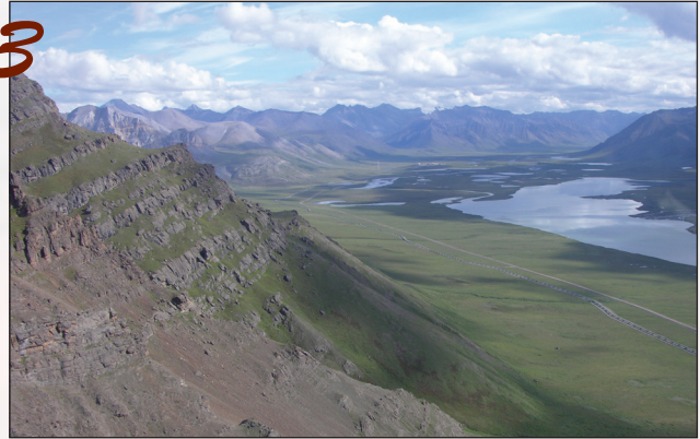
1, Icebergs immediately offshore from Ilulissat, Greenland; 2, Snowy peaks and muddy tidal flats of Cook Inlet, south of Anchorage, Alaska; and 3, Valley of the Atigun River with the Trans-Alaska Pipeline near Galbraith, Alaska.