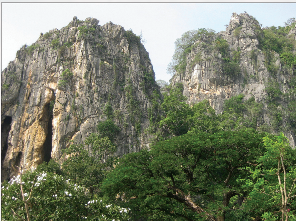
Vertical limestone beds forming cliffs along Three Pagodas Fault Zone, near Hua Hin, Thailand.