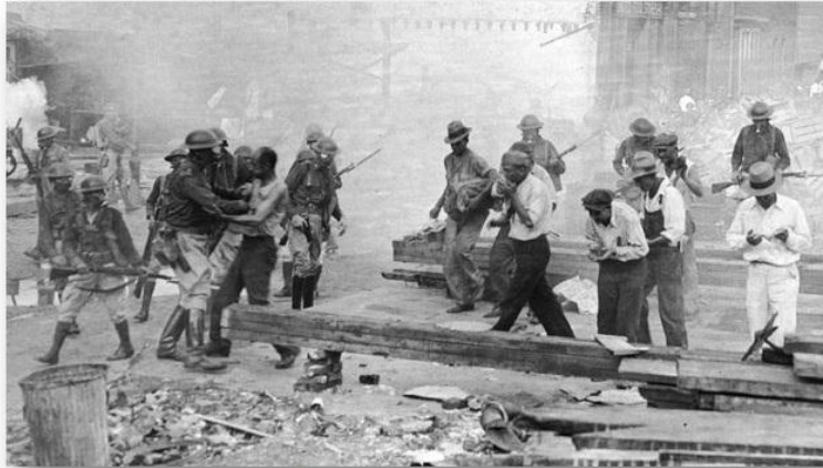
Bonus Army - Summer of 1932