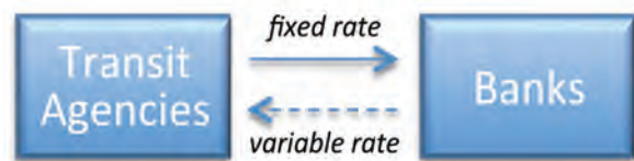
FIGURE 1: The Structure of an Interest Rate Swap Deal

When governments and transit agencies issued variable-rate bonds, banks offered them a deal. The banks said that if the agencies would pay them a steady, fixed interest rate, then the banks would pay them back a variable rate that they could use to pay the interest on the bonds. Banks sold these deals as insurance policies that would let taxpayers lock in lower interest rates without having to worry about rates shooting up in the future. However, these deals were actually more of a gamble than an insurance policy. If variable