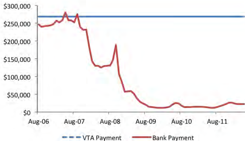
FIGURE 7: Monthly Payments on VTA's Measure A 2008A Swap Deal 104

The VTA pays twice that amount to Wall Street banks on its toxic swap deals. The VTA is losing $13 million annually on its swap deals with four banks: Bank of America, Citigroup, Goldman Sachs, and Morgan Stanley. 103 Figure 7 below looks at the VTA's swap deal in connection with the Measure A 2008A bonds. The graph shows that the deal made sense through the end of 2007, but that once the federal government started driving down interest rates in 2008, the VTA's losses skyrocketed.