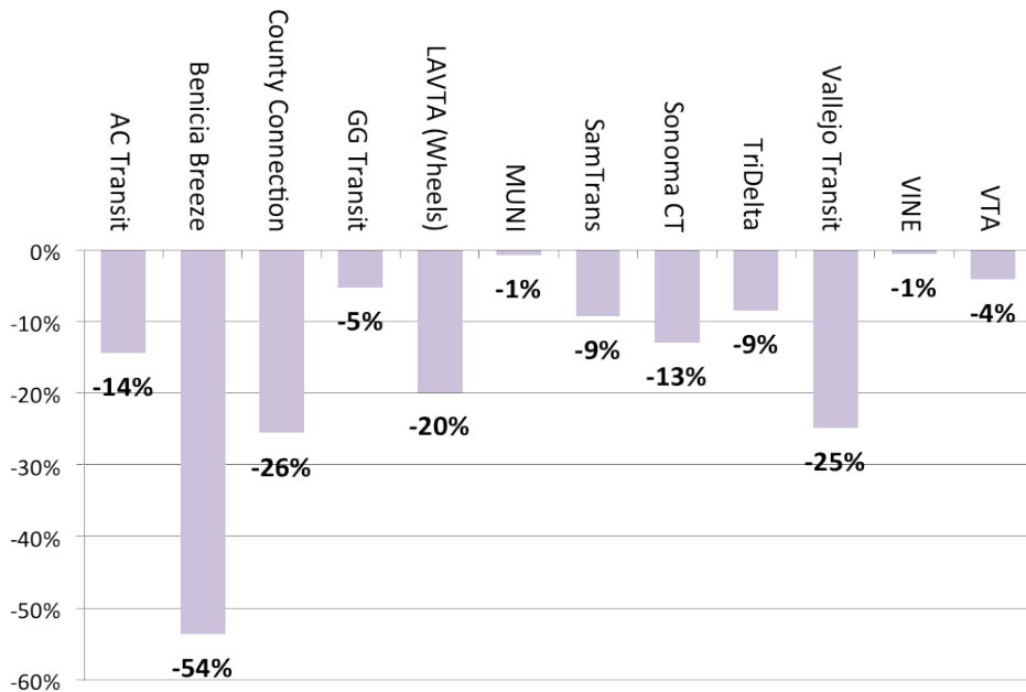
FIGURE 6: Bus Service Cuts on MTC Operators (2006-2011) 98

But while the MTC is forced to send millions to Wall Street, transit riders are feeling the squeeze. Facing historic budget deficits between 2008 and 2010, nearly every single bus operator cut service and raised fares, reducing transit affordability, reliability and in some cases eliminating bus lines altogether. Some operators cut as much as 50% of service, of which little has been restored. Across the Bay Area, 8% of all bus service was cut. 95 These cuts have left entire communities stranded. One in four transit riders in the Bay Area does not have a car and is dependent on public transit to get around. 96 Ridership has fallen dramatically as a result of the cuts, averaging 55,000 fewer trips taken each day. It would cost an estimated $72.5 million to restore the lost service with fixed route bus transit. 97