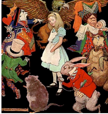
Peter Newell's illustration of Alice surrounded by the characters of Wonderland. (1890)