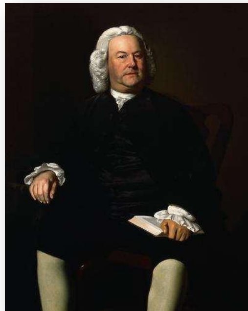
JAMES OTIS, SR. (1702–1778)

defendant is called upon to answer for bruising the grass and even treading upon the soil. If he admits the fact, he is bound to show by way of justification, that some positive law has empowered or excused him. The justification is submitted to the judges, who are to look into the books; and if such a justification can be maintained by the text of the statute law, or by the principles of common law. If no excuse can be found or produced, the silence of the books is an authority against the defendant, and the plaintiff must have judgment."